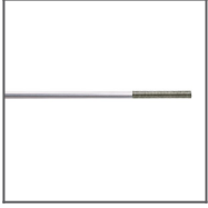
K0G-AB Arm Ref: 42102