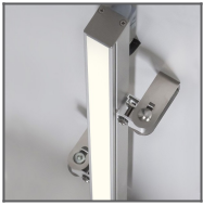
HR-OPTI System Ref: C1844 (HR- OPTI) + 42121