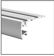
STEP Profile Ref: 18042