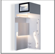
Display P230-90083M Ref: 90083M