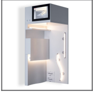
Display P230-90083M Ref: 90083M