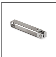
HR-OPTI-A Mounting bracket Ref: _