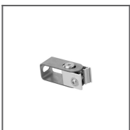
HR-OPTI Mounting bracket Ref: 42121