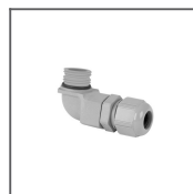
M16 x 1,5 - L90 Angular gland Ref: 42289