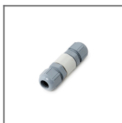
Hermetic coupler Ref: 42702