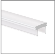
HR-21 frosted Cover Ref: 17152