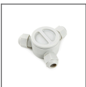
Hermetic splitter Ref: 42703