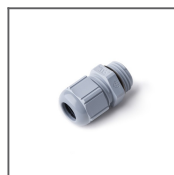
M16 x 1.5 Gland Ref: 42271