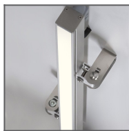
HR-OPTI System Ref: C1844 (HR- OPTI) + 42121