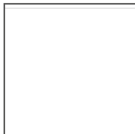
GLADES A18036 Ref. arch 18036