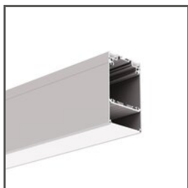
DES A18030 Ref. arch 18030