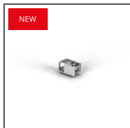
MOUNTING BRACKET HR-OPTI-45 C28091N00 Ref. arch 42125