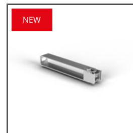
MOUNTING BRACKET HR-OPTI-155 C28095N00 Ref. arch 42124