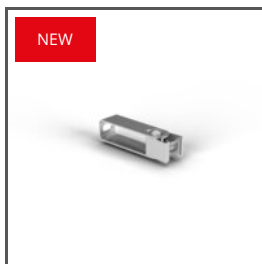
MOUNTING BRACKET HR-OPTI-90 C28093N00 Ref. arch 42170