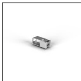
MOUNTING BRACKET HR-OPTI C28090N00 Ref. arch 42121