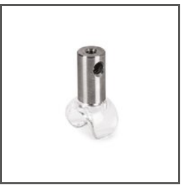
FASTENER PLD-10-PP C28175N00 Ref. arch 42291