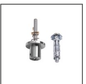
FASTENER P-KG-Z C28199N00, C28199L07, C28199L10 Ref. arch 42553, 42553L9005, 42553L9010