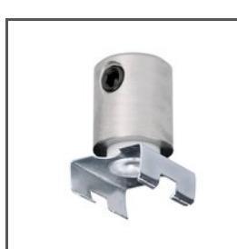
FASTENER DP-45-MOC C28256N00 Ref. arch 00652