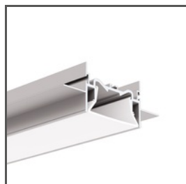
FOLED-50 A03632 Ref. arch C3632