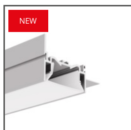
FOLED-50-BOK A0A57945 Ref. arch SA57945