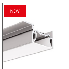
FOLED-50-SUF A03631 Ref. arch C3631