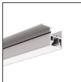
FOLED-SUF A08333V1 Ref. arch B8333V1