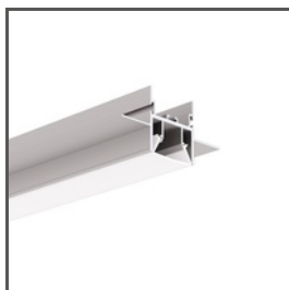
FOLED A08332V1 Ref. arch B8332V1