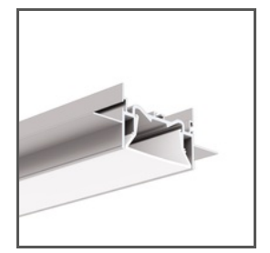
FOLED-50 A03632 Ref. arch C3632