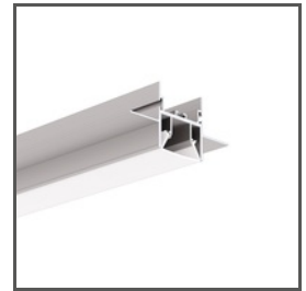
FOLED A08332V1 Ref. arch B8332V1