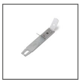
SPRING HANGER Z71000 Ref. arch 79106