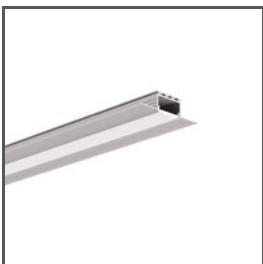
KOZUS A07823 Ref. arch B7823