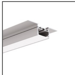
GIZA-LL-UST A02724N Ref. arch C2724