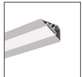
LOC-30 A18015 Ref. arch 18015