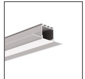
KOZEL A06454 Ref. arch B6454