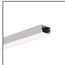
GLAZA-LL A02627 Ref. arch C2627