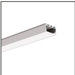
GIZA-LL A00758 Ref. arch C0758