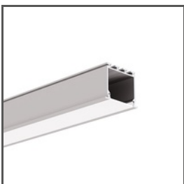
LOKOM A05553 Ref. arch B5553