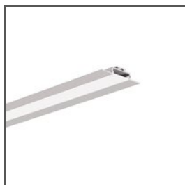
OPAC-30 A06164 Ref. arch B6164