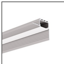
KOZUS-CR A00600 Ref. arch C0600