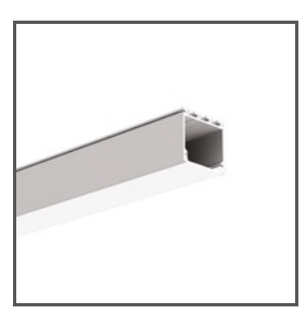
LIPOD A05554 Ref. arch B5554