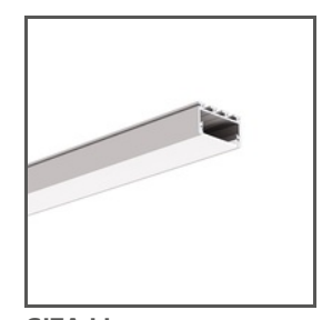
GIZA-LL A00758 Ref. arch C0758