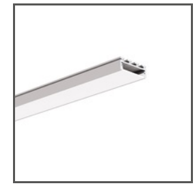
GIZA A05556 Ref. arch B5556