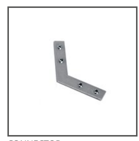
CONNECTOR ZM-NA-120 C28242N00 Ref. arch 42729