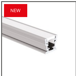
HR-MAX A01829+A01827+A01828 Ref. arch C1829+C1827+C1828