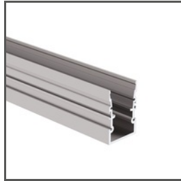
HR-MAX-TW A01828 Ref. arch C1828