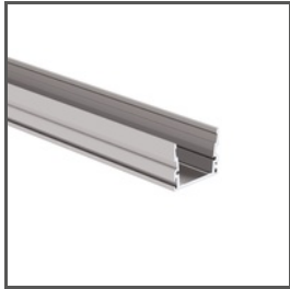
HR-MAX-T A01827 Ref. arch C1827