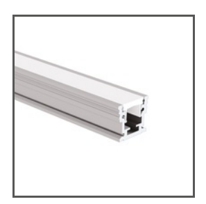
HR-MAX A01829 Ref. arch C1829