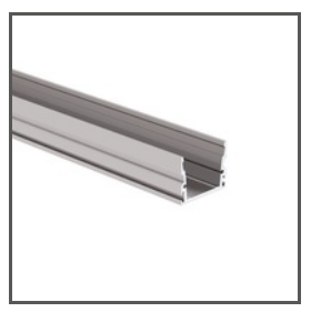
HR-MAX-T A01827 Ref. arch C1827