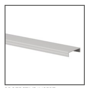
PROTECTIVE INSERT TECH-35 C24534C02 Ref. arch 17127