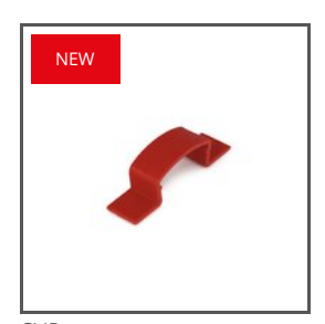
CLIP HR-MAX C28059C00 Ref. arch 24416