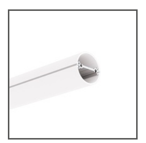
JAZ-DUO A00788 Ref. arch C0788