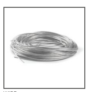
WIRE FI-1,35mm Z70310 Ref. arch 70310