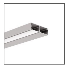
KIDES A18031 Ref. arch 18031