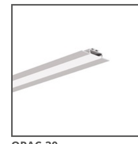
OPAC-30 A06164 Ref. arch B6164