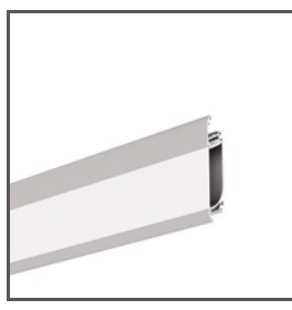
OBIT A04826 Ref. arch W4826