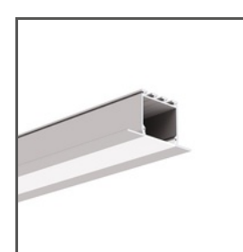
LARKO A05552 Ref. arch B5552