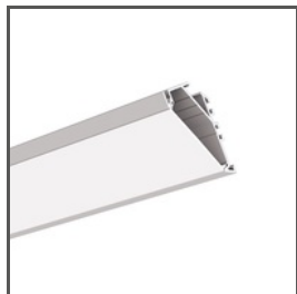
KOPRO-30 A07890 Ref. arch B7890