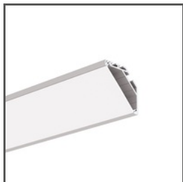
KOPRO A06367 Ref. arch B6367