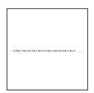
K-1091-24V K-1091-24 Ref. arch K-1091-24V