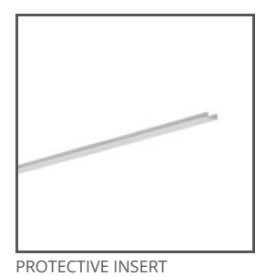
TECH-10 C24533C02 Ref. arch 17126