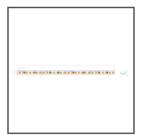
5K-WP-K-1091-24V KWP-5K-1091-24 Ref. arch 5K-WP-K-1091-24V