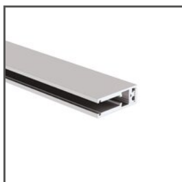
KRAV-56 A18017AZM Ref. arch 18017