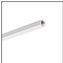
PIKO-O A01167 Ref. arch C1167