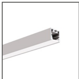
PDS-ZM-PLUS A02056 Ref. arch C2056