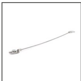
SECURING LINE ZM-1 Z70520 Ref. arch 70520