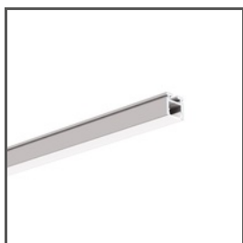
PIKO-ZM A01168 Ref. arch C1168