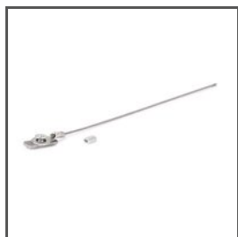
SECURING LINE ZM-2 Z70521 Ref. arch 70521