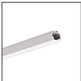
OLEK A08505 Ref. arch B8505