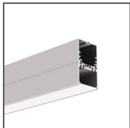
4050-W A18051 Ref. arch 18051