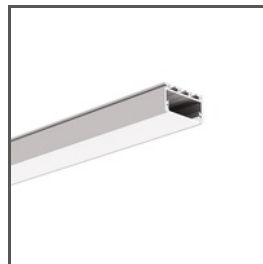
GIZA-LL A00758 Ref. arch C0758