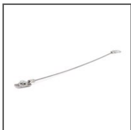
SECURING LINE ZM-1 Z70520 Ref. arch 70520