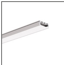
GIZA A05556 Ref. arch B5556