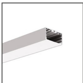
LIPOD-50 A02609 Ref. arch C2609