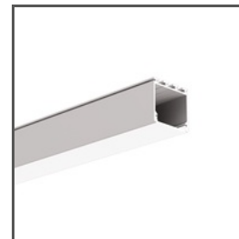
LIPOD A05554 Ref. arch B5554