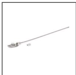
SECURING LINE ZM-2 Z70521 Ref. arch 70521