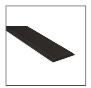
MOUNTING PAD 45 Z70457 Ref. arch 70457