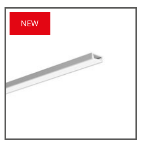
MICRO-PLUS A02966 Ref. arch C2966