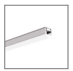
REGULOR A18068 Ref. arch B468+43