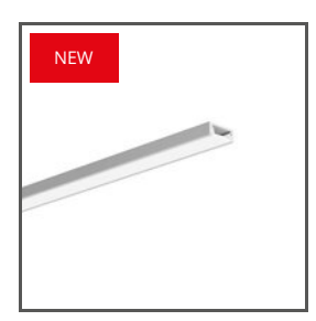
MICRO-PLUS A02966 Ref. arch C2966