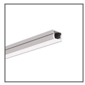
PDS-4-PLUS A01263 Ref. arch C1263