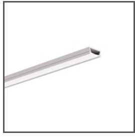
TAMI A05390 Ref. arch B5390