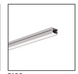
TAPO A01919 Ref. arch C1919