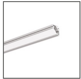
45-16 A08504 Ref. arch B8504