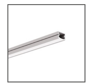
TAPO A01919 Ref. arch C1919