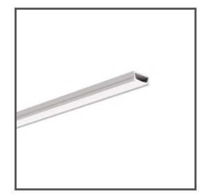
TAMI A05390 Ref. arch B5390