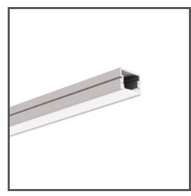
PDS-4-PLUS A01263 Ref. arch C1263