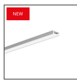
MICRO-PLUS A02966 Ref. arch C2966