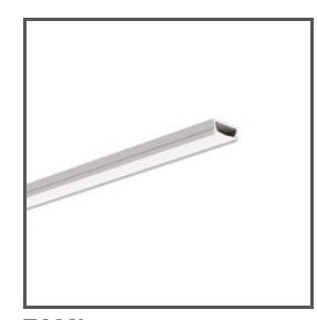
TAMI A05390 Ref. arch B5390