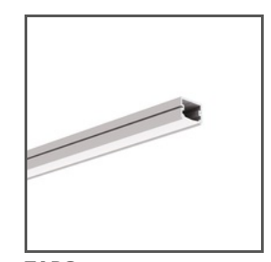
TAPO A01919 Ref. arch C1919