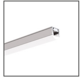
REGULOR A18068 Ref. arch B468+43