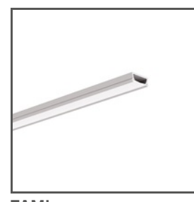
TAMI A05390 Ref. arch B5390