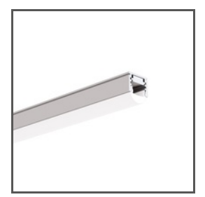
REGULOR A18068 Ref. arch B468+43