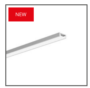
MICRO-PLUS A02966 Ref. arch C2966