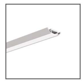
STOS-ALU A04369 Ref. arch B4369