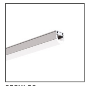
REGULOR A18068 Ref. arch B468+43