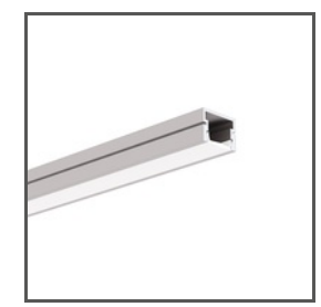
PDS-4-PLUS A01263 Ref. arch C1263