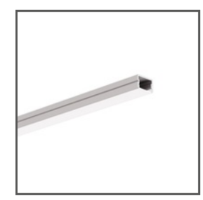
SILER A09325 Ref. arch B9325