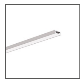
MICRO-ALU A01888 Ref. arch B1888