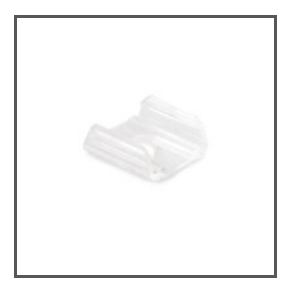
MOUNTING BRACKET K-10 C24340C00 Ref. arch 24340