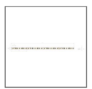
K-1091-24V K-1091-24 Ref. arch K-1091-24V