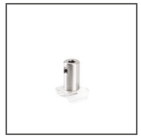
FASTENER K-10-WP C28236N00 Ref. arch 42671