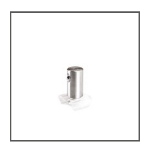
FASTENER K-10-WL C28237N00 Ref. arch 42672