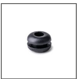
GLAND 6x1,2 C24517C07 Ref. arch 00802