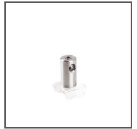
FASTENER K-10-PP C28235N00 Ref arch 42670