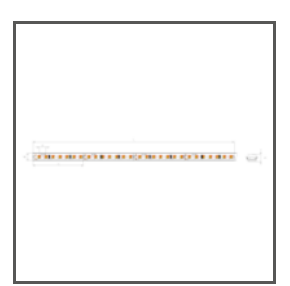
5K-WP-K-1091-24V KWP-5K-1091-24 Ref. arch 5K-WP-K-1091-24V