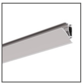
PULA A18035 Ref. arch 18035