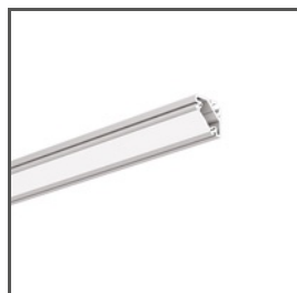
45-16 A08504 Ref. arch B8504