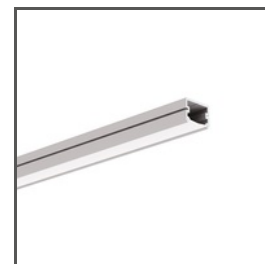
TAPO A01919 Ref. arch C1919