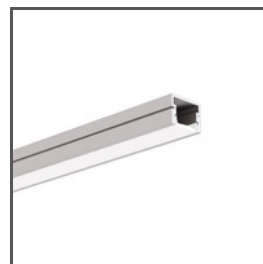
PDS-4-PLUS A01263 Ref. arch C1263