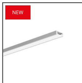
MICRO-PLUS A02966 Ref. arch C2966