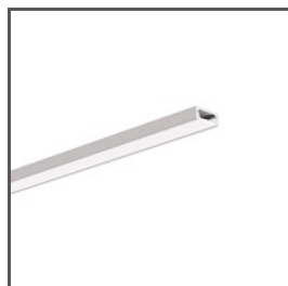
MICRO-ALU A01888 Ref. arch B1888