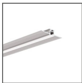
KOZEL-10 A01575 Ref. arch C1575