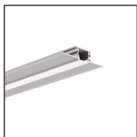
KOZMA A18040 Ref. arch 18040