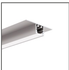
PDS-T A02057 Ref. arch C2057