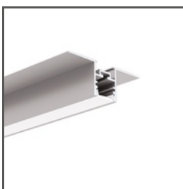
PDS-UST A02725 Ref. arch C2725