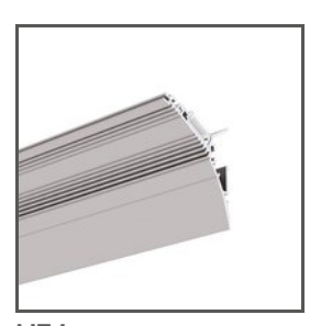
LIT-L A18033 Ref. arch 18033