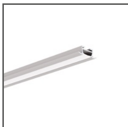
TAKO A05392 Ref. arch B5392