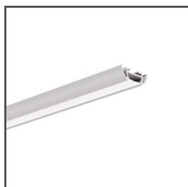
TOST A05393 Ref. arch B5393